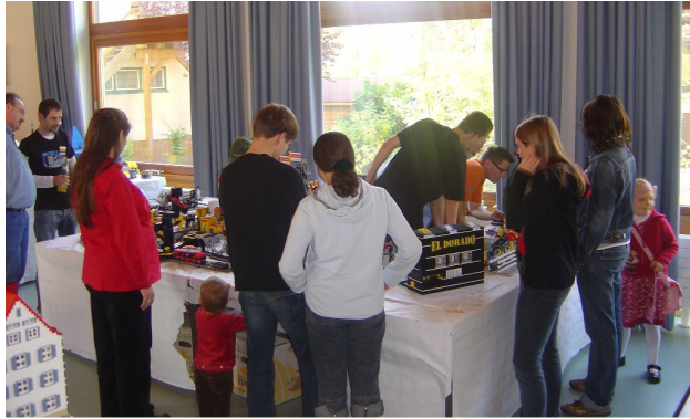
Having always something moving: balls