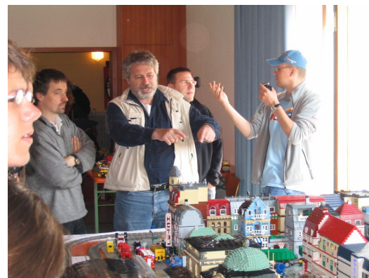
or giving explanations

All in all it was a nice event and all were really feeling comfortable, the Bricking Bavaria team, the guests and the visitors.